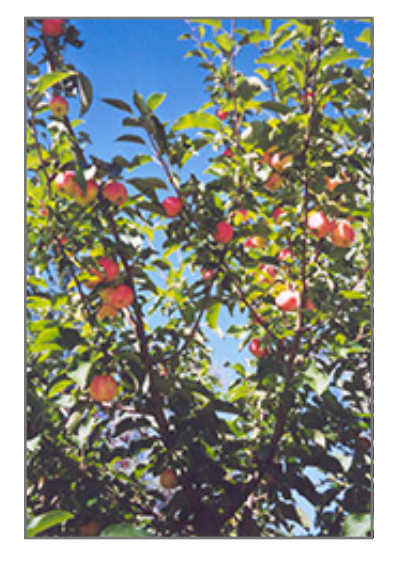
September Ruby Apple fruit

22040 Township Road 522 Sherwood Park, AB (587) 600-2231 www.sherwoodnurseries.ca