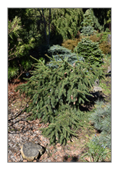
Red Cone Spruce

22040 Township Road 522 Sherwood Park, AB (587) 600-2231 www.sherwoodnurseries.ca