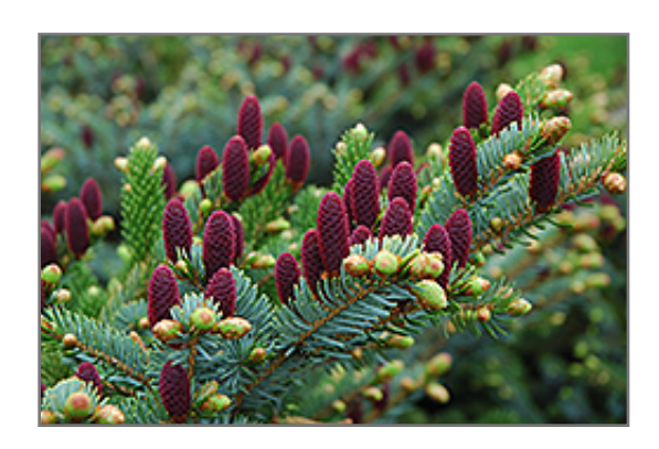
Red Cone Spruce fruit

Red Cone Spruce is recommended for the following landscape applications;