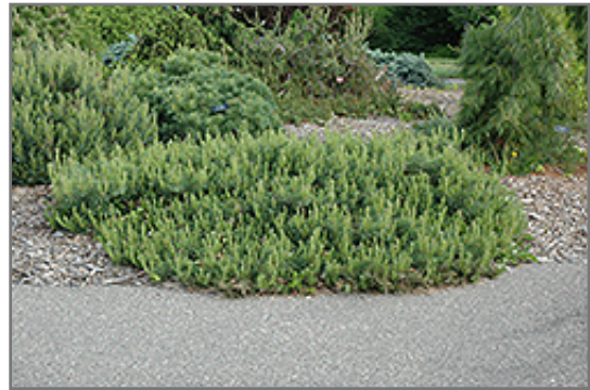
Hillside Creeper Scotch Pine

Hillside Creeper Scotch Pine will grow to be about 24 inches tall at maturity, with a spread of 7 feet. It tends to fill out right to the ground and therefore doesn't necessarily require facer plants in front. It grows at a medium rate, and under ideal conditions can be expected to live for 40 years or more.