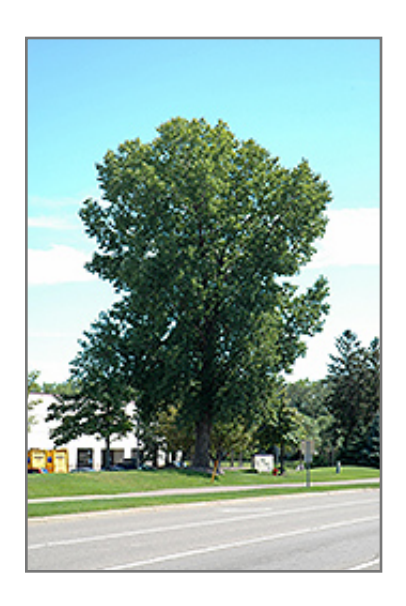
Siouxland Poplar