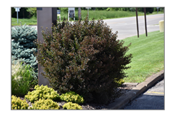
Little Devil Ninebark

Little Devil Ninebark is recommended for the following landscape applications;