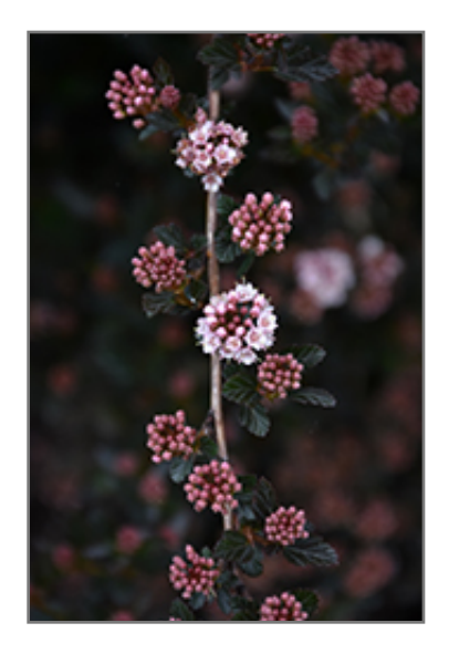
Little Devil Ninebark flowers

22040 Township Road 522 Sherwood Park, AB (587) 600-2231 www.sherwoodnurseries.ca