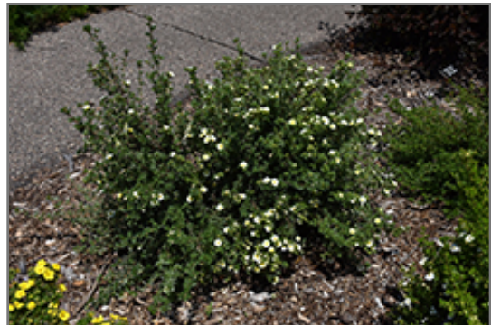
Katherine Dykes Potentilla in bloom