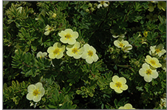
Katherine Dykes Potentilla flowers