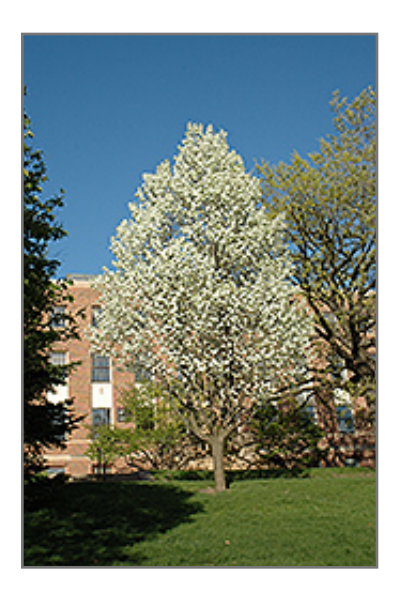
Mountain Frost Pear in bloom

Mountain Frost Pear is recommended for the following landscape applications;