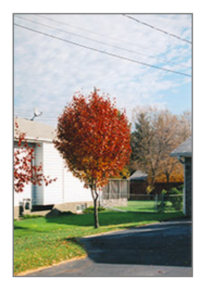
Mountain Frost Pear in fall

22040 Township Road 522 Sherwood Park, AB (587) 600-2231 www.sherwoodnurseries.ca