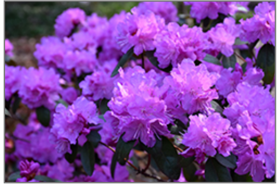
P.J.M. Elite Rhododendron flowers

P.J.M. Elite Rhododendron is recommended for the following landscape applications;