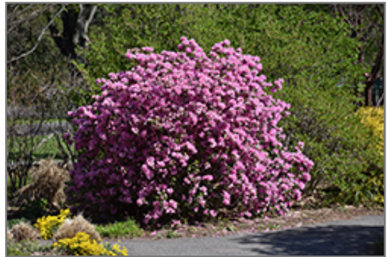
P.J.M. Elite Rhododendron in bloom