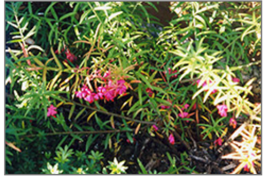
Dwarf Turkestan Burning Bush flowers

This shrub performs well in both full sun and full shade. It is very adaptable to both dry and moist locations, and should do just fine under typical garden conditions. It is not particular as to soil type or pH. It is highly tolerant of urban pollution and will even thrive in inner city environments. This is a selected variety of a species not originally from North America.