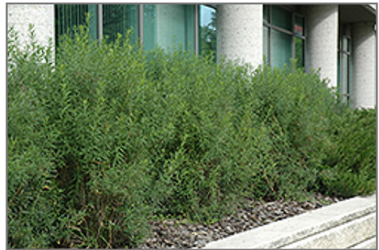
Dwarf Turkestan Burning Bush