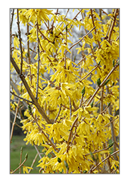
Northern Gold Forsythia flowers

22040 Township Road 522 Sherwood Park, AB (587) 600-2231 www.sherwoodnurseries.ca