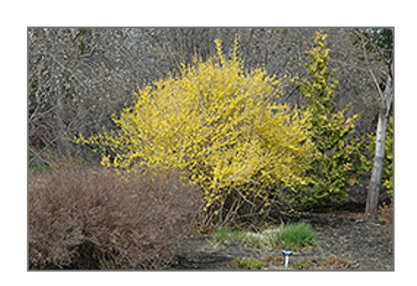
Northern Gold Forsythia in bloom

Northern Gold Forsythia is recommended for the following landscape applications;