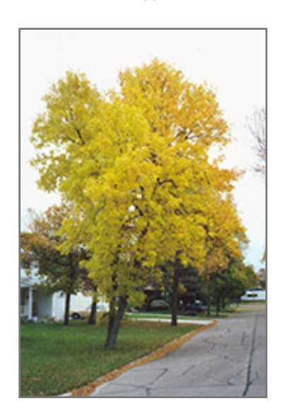
Green Ash in fall