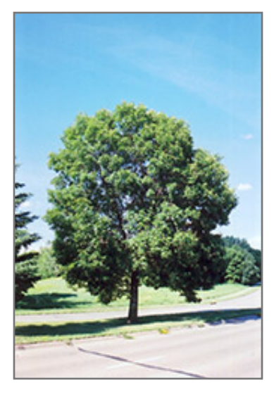
Green Ash