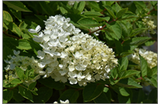
Bombshell Hydrangea flowers