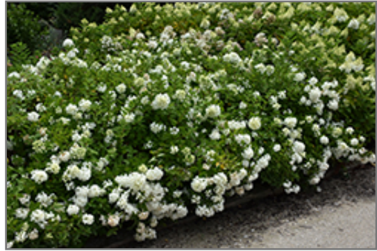
Bombshell Hydrangea in bloom