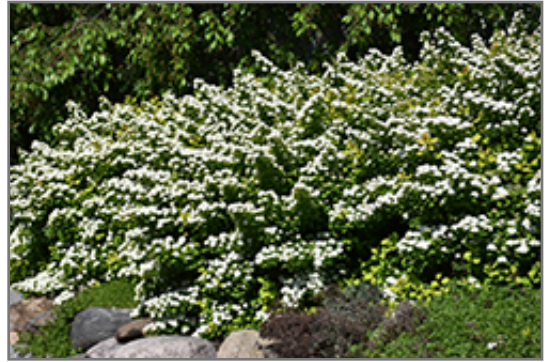
Glow Girl Birch Leaf Spirea in bloom

Glow Girl Birch Leaf Spirea is recommended for the following landscape applications;