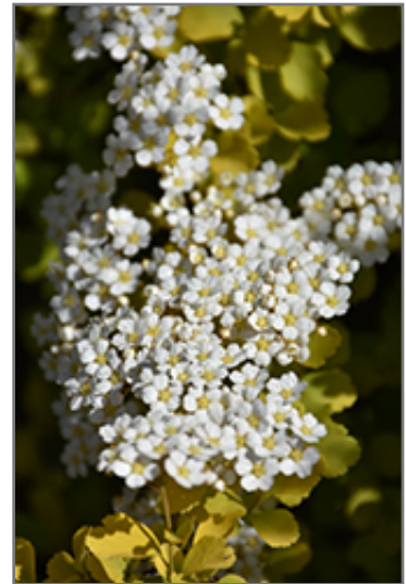
Glow Girl Birch Leaf Spirea flowers