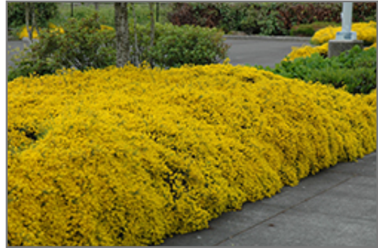
Lydia Woadwaxen in bloom