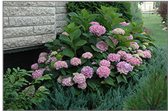
Endless Summer The Original Hydrangea in bloom

Endless Summer The Original Hydrangea will grow to be about 4 feet tall at maturity, with a spread of 4 feet. It tends to fill out right to the ground and therefore doesn't necessarily require facer plants in front. It grows at a fast rate, and under ideal conditions can be expected to live for approximately 20 years.