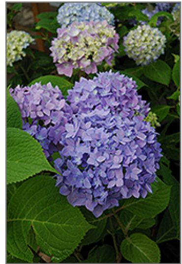
Endless Summer The Original Hydrangea flowers