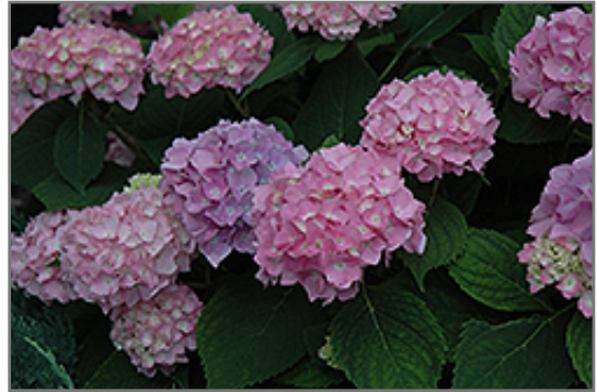
Endless Summer The Original Hydrangea flowers

Endless Summer The Original Hydrangea is recommended for the following landscape applications;