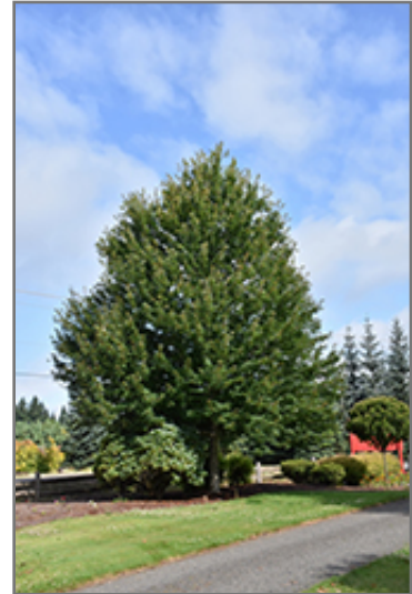
Redpointe Red Maple