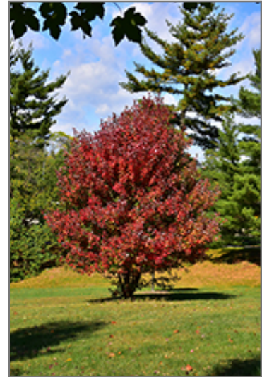
Redpointe Red Maple in fall

This tree should only be grown in full sunlight. It is quite adaptable, preferring to grow in average to wet conditions, and will even tolerate some standing water. It is not particular as to soil type, but has a definite preference for acidic soils, and is subject to chlorosis (yellowing) of the foliage in alkaline soils. It is somewhat tolerant of urban pollution. This is a selection of a native North American species.