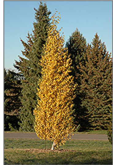
Dakota Pinnacle Japanese White Birch in fall