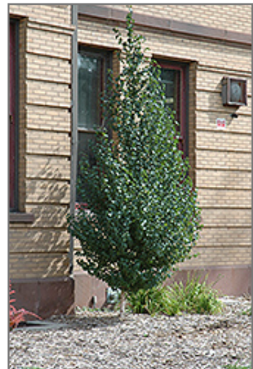
Dakota Pinnacle Japanese White Birch