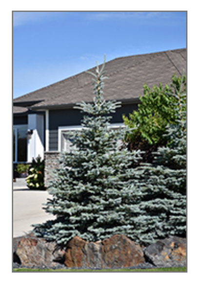
Baby Blue Blue Spruce