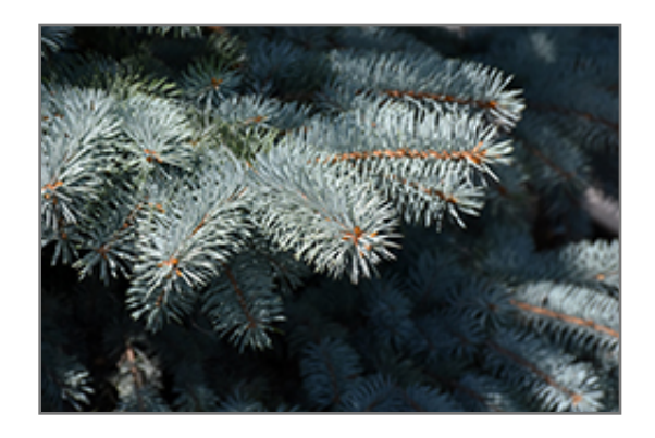
Baby Blue Blue Spruce foliage

22040 Township Road 522 Sherwood Park, AB (587) 600-2231 www.sherwoodnurseries.ca