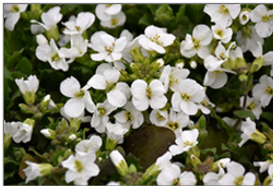
Snowcap Wall Cress flowers