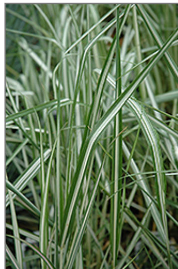
Avalanche Reed Grass foliage