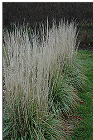
Avalanche Reed Grass in fall

Avalanche Reed Grass is recommended for the following landscape applications;