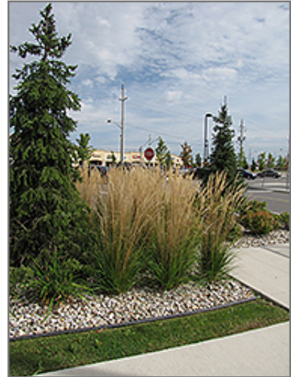
Karl Foerster Reed Grass in bloom

Karl Foerster Reed Grass is a fine choice for the garden, but it is also a good selection for planting in outdoor pots and containers. With its upright habit of growth, it is best suited for use as a 'thriller' in the 'spiller-thriller-filler' container combination; plant it near the center of the pot, surrounded by smaller plants and those that spill over the edges. It is even sizeable enough that it can be grown alone in a suitable container. Note that when growing plants in outdoor containers and baskets, they may require more frequent waterings than they would in the yard or garden. Be aware that in our climate, most plants cannot be expected to survive the winter if left in containers outdoors, and this plant is no exception. Contact our experts for more information on how to protect it over the winter months.