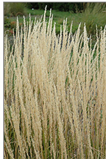
Karl Foerster Reed Grass flowers