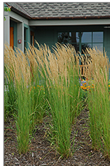
Karl Foerster Reed Grass

Karl Foerster Reed Grass is recommended for the following landscape applications;