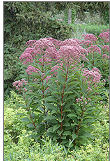
Joe Pye Weed in bloom