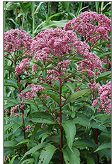
Joe Pye Weed flowers

Joe Pye Weed is recommended for the following landscape applications;