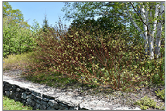
Bailey's Red Twig Dogwood in spring