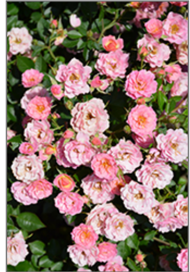
Oso Easy Petit Pink flowers