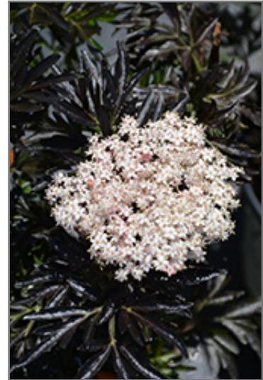
Laced Up Elder flowers

Laced Up Elder is recommended for the following landscape applications;