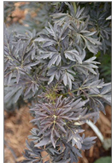
Laced Up Elder foliage