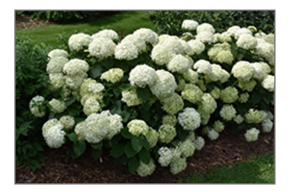
Invincibelle Limetta Hydrangea in bloom

22040 Township Road 522 Sherwood Park, AB (587) 600-2231 www.sherwoodnurseries.ca