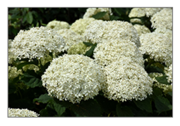
Invincibelle Limetta Hydrangea flowers