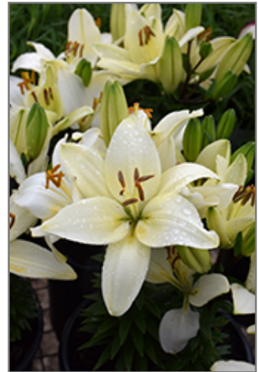
Lily Looks Tiny Crystal Lily flowers

This variety is a compact lily that bears well formed, upward facing, crystal clear white blooms with a hint of green; perfect for containers or massing along borders; they are also known to have multiple blooms per stem