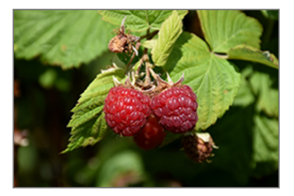
Nova Raspberry fruit

Nova Raspberry is a medium-sized shrub that is typically grown for its edible qualities. It produces red heart-shaped berries which are usually ready for picking in mid summer. The berries have a sweet taste and a juicy texture.