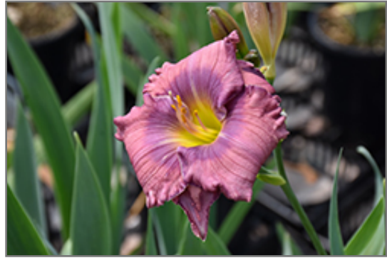
Lavender Blue Baby Daylily flowers