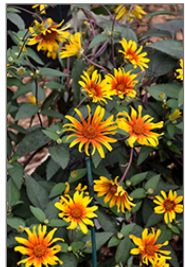
Burning Hearts False Sunflower flowers