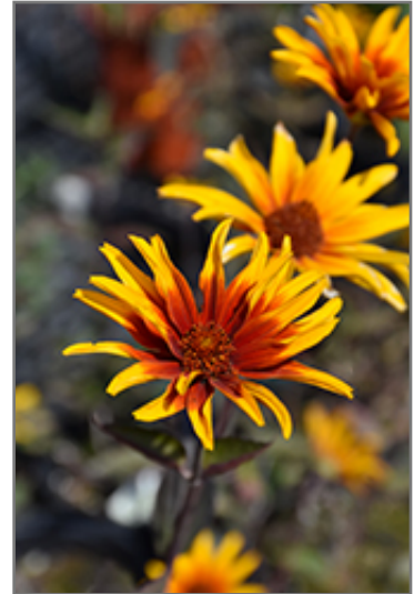
Burning Hearts False Sunflower flowers

This is a relatively low maintenance plant, and is best cleaned up in early spring before it resumes active growth for the season. It is a good choice for attracting butterflies to your yard, but is not particularly attractive to deer who tend to leave it alone in favor of tastier treats. It has no significant negative characteristics.