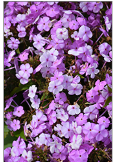
Fashionably Early Princess Garden Phlox flowers