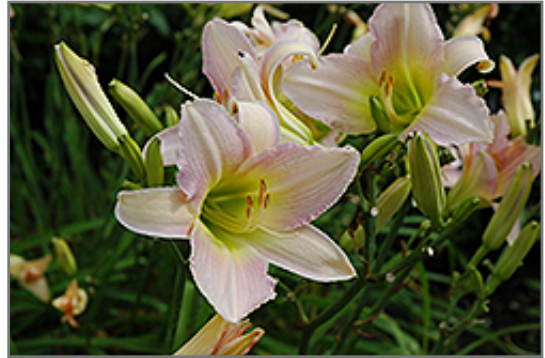
Catherine Woodbury Daylily flowers

Elegant lavender-pink, ruffled blooms with bright green eyes and touches of yellow brings a softness to borders, beds and containers; strong sturdy stems rise above low growing mounds of arching foliage; heat and drought tolerant; midseason bloomer