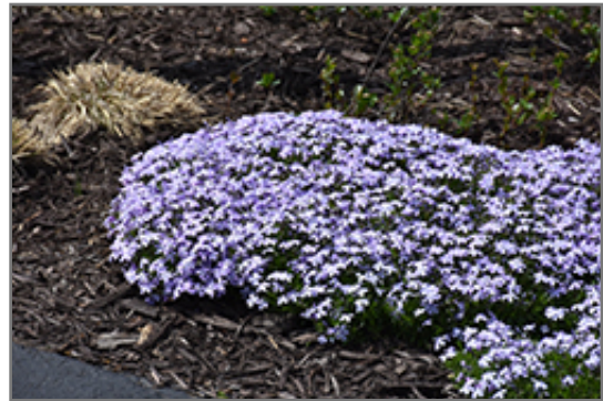
Spring Blue Moss Phlox in bloom