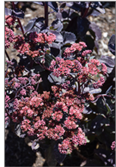
Thunderhead Stonecrop flowers