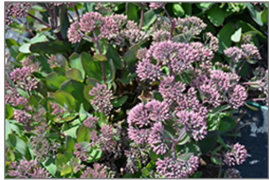
Thunderhead Stonecrop flower buds

Thunderhead Stonecrop is recommended for the following landscape applications;