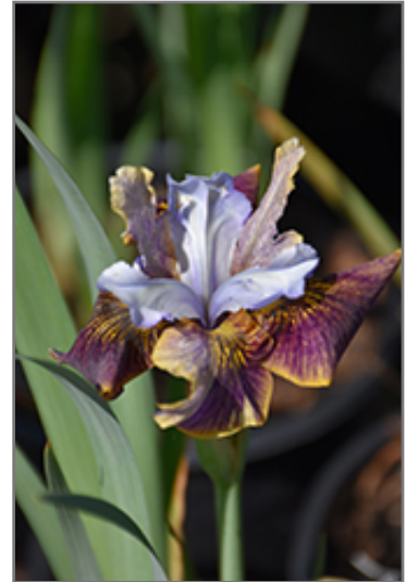
Black Joker Siberian Iris flowers