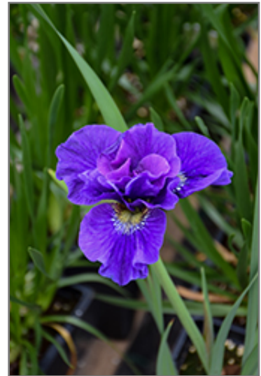
Concord Crush Siberian Iris flowers