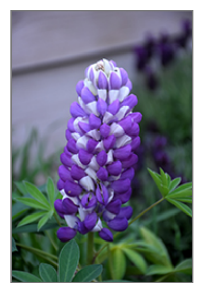
Mini Gallery Blue Bicolor Lupine flowers