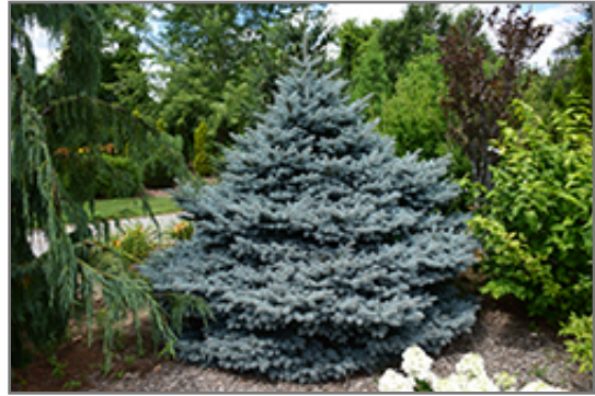
Montgomery Blue Spruce

Other Names: Blue Colorado Spruce; Colorado Blue Spruce