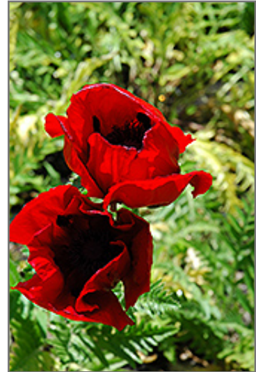
Brilliant Poppy flowers