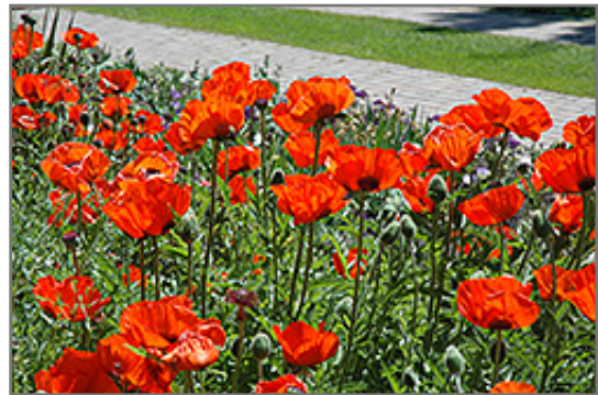
Brilliant Poppy flowers