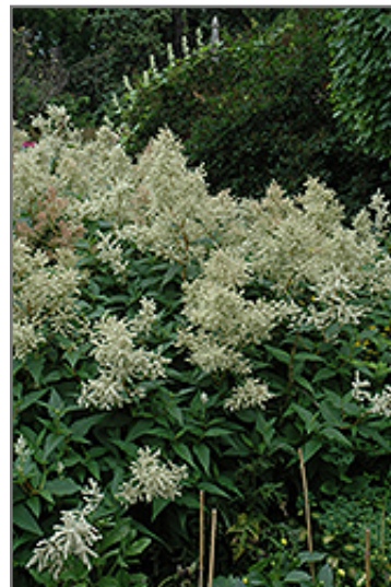
White Fleeceflower in bloom