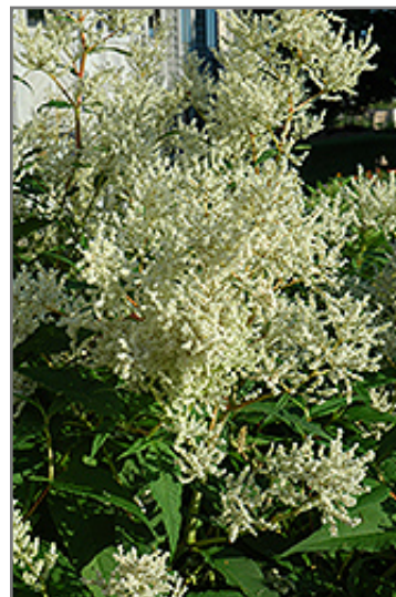
White Fleeceflower flowers