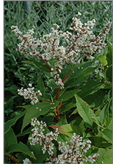
White Fleeceflower flowers

This plant does best in full sun to partial shade. It prefers to grow in average to moist conditions, and shouldn't be allowed to dry out. It is not particular as to soil type or pH. It is highly tolerant of urban pollution and will even thrive in inner city environments. This species is not originally from North America. It can be propagated by division.