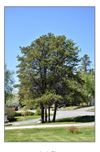
Jack Pine

Jack Pine will grow to be about 45 feet tall at maturity, with a spread of 35 feet. It has a low canopy with a typical clearance of 4 feet from the ground, and should not be planted underneath power lines. It grows at a slow rate, and under ideal conditions can be expected to live for 80 years or more.