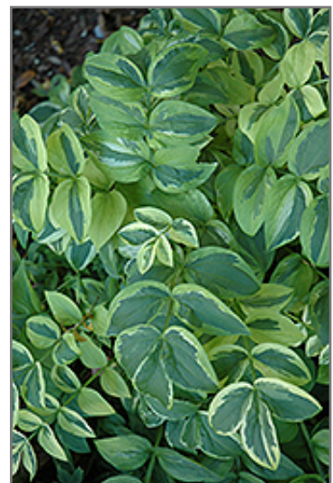
Stairway To Heaven Jacob's Ladder foliage