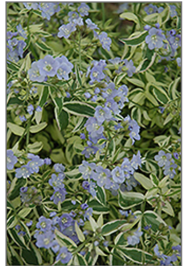
Stairway To Heaven Jacob's Ladder flowers