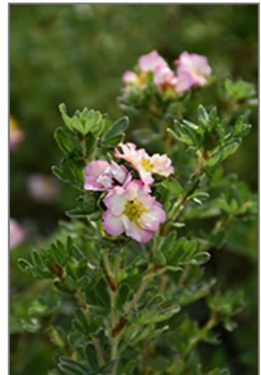
Happy Face Hearts Potentilla flowers