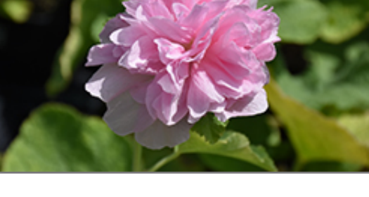
Peaches n' Dreams Hollyhock flowers