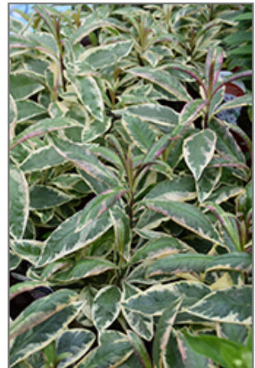
Olympus Garden Phlox foliage