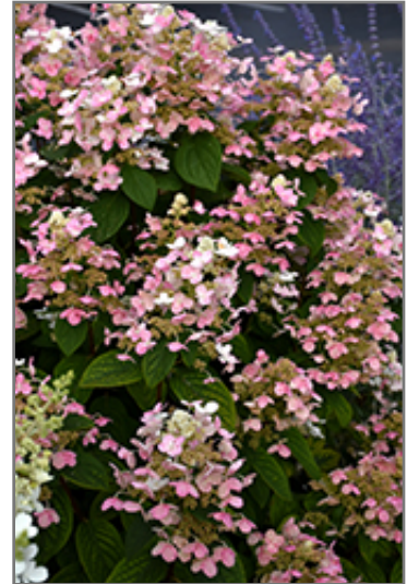
Quick Fire Hydrangea flowers