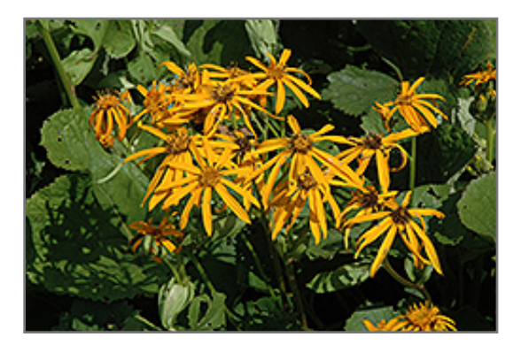
Othello Rayflower flowers