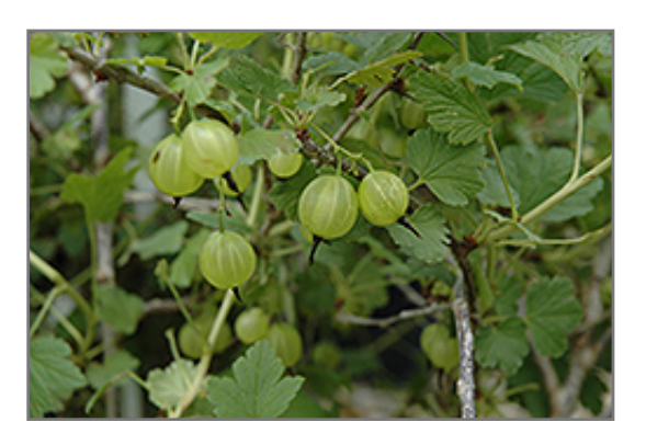
Hinnonmaki Yellow Gooseberry fruit