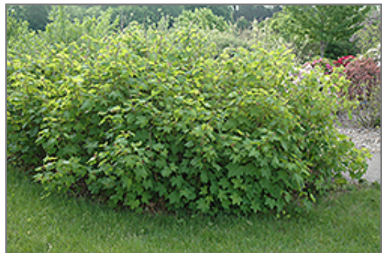
Flowering Raspberry