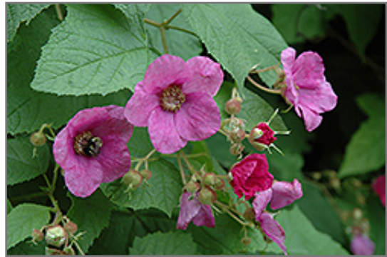
Flowering Raspberry flowers