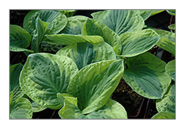
Brim Cup Hosta foliage